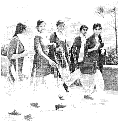
Std VI to VIII Girls Students Color White & Blue