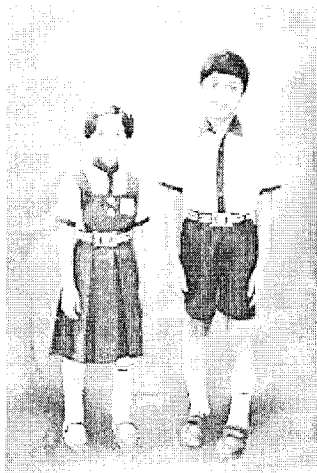
Std I to V Girls & Boys