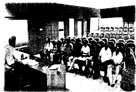
(Photo of Public Hearing held on 23/12/2019 at D.M.C. Conference Hall, Diu)